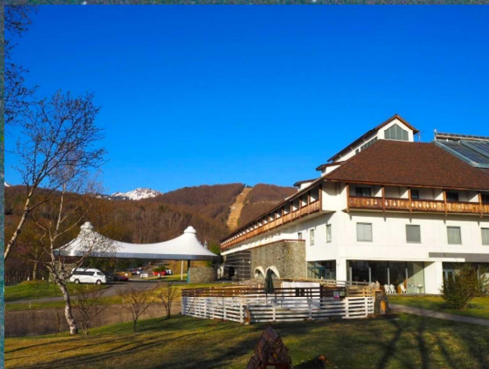
Koumi RE-EX Hotel

*Fee includes grand transportation, accommodation, meals, all camp activities and bank wire transfer fee (in Japan)